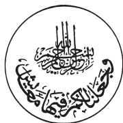
International Association of Islamic Economics